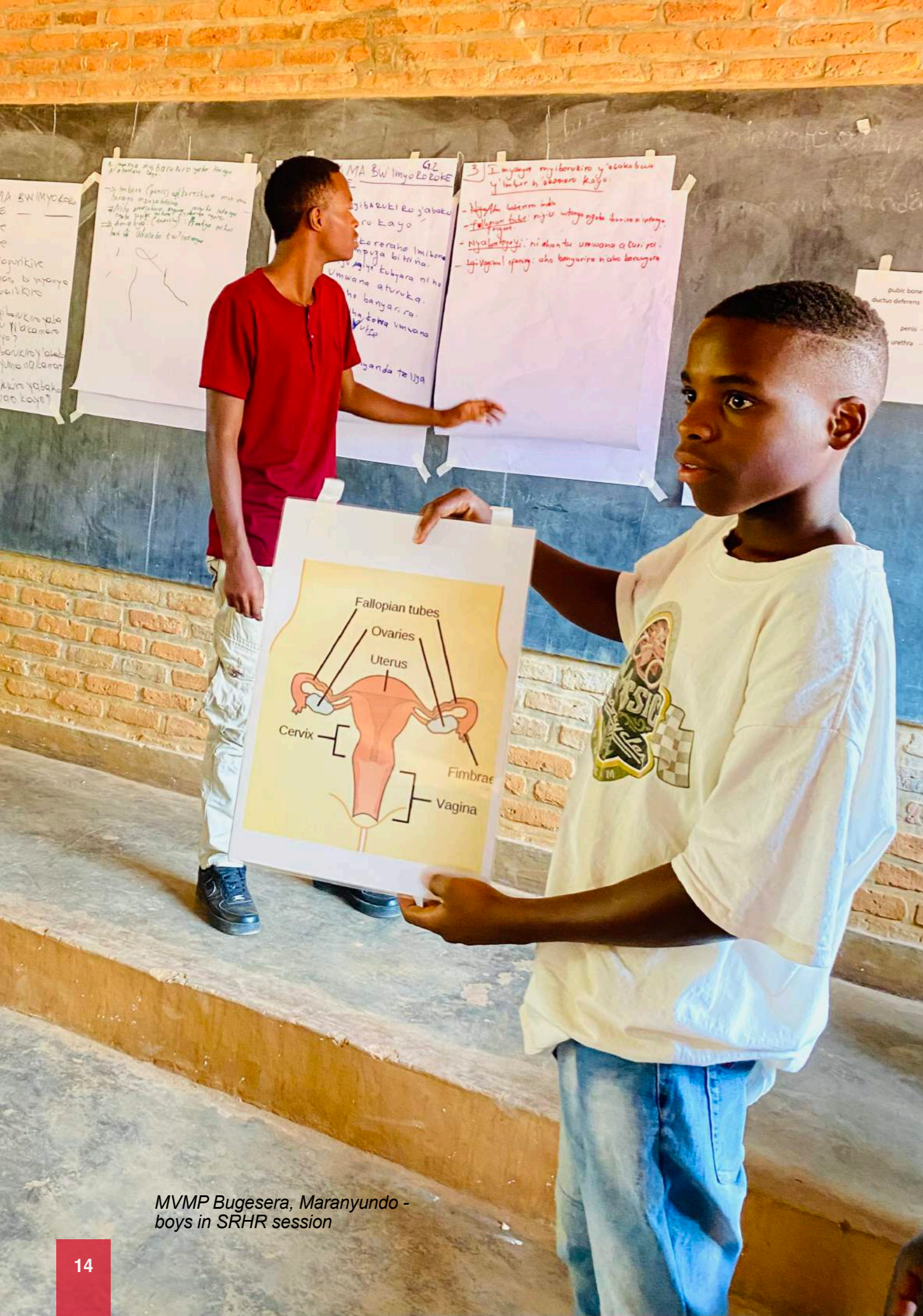
MVMP Bugesera, Maranyundo - boys in SRHR session