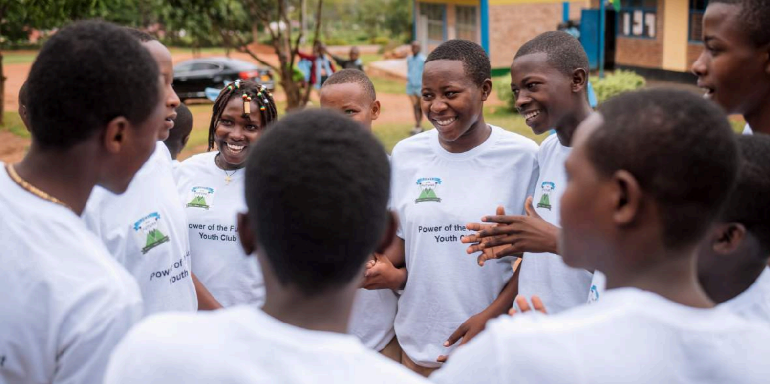
Above: Participants of MVMP at Bugesera, Maranyundo working in groups.