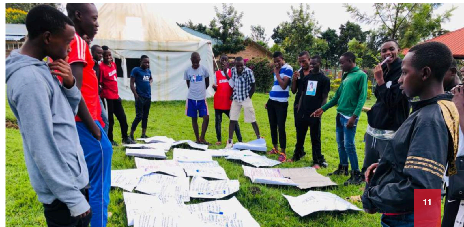
Below: MVMP-Kayonza: Boys in Confronting and healing ourselves session.

Through these initiatives, we reached over 350 direct participants and engaged with over 480 communities in Kayonza and Bugesera Districts. We're thrilled to witness the impact of our programs and the commitment of young activists in driving positive change within their communities.