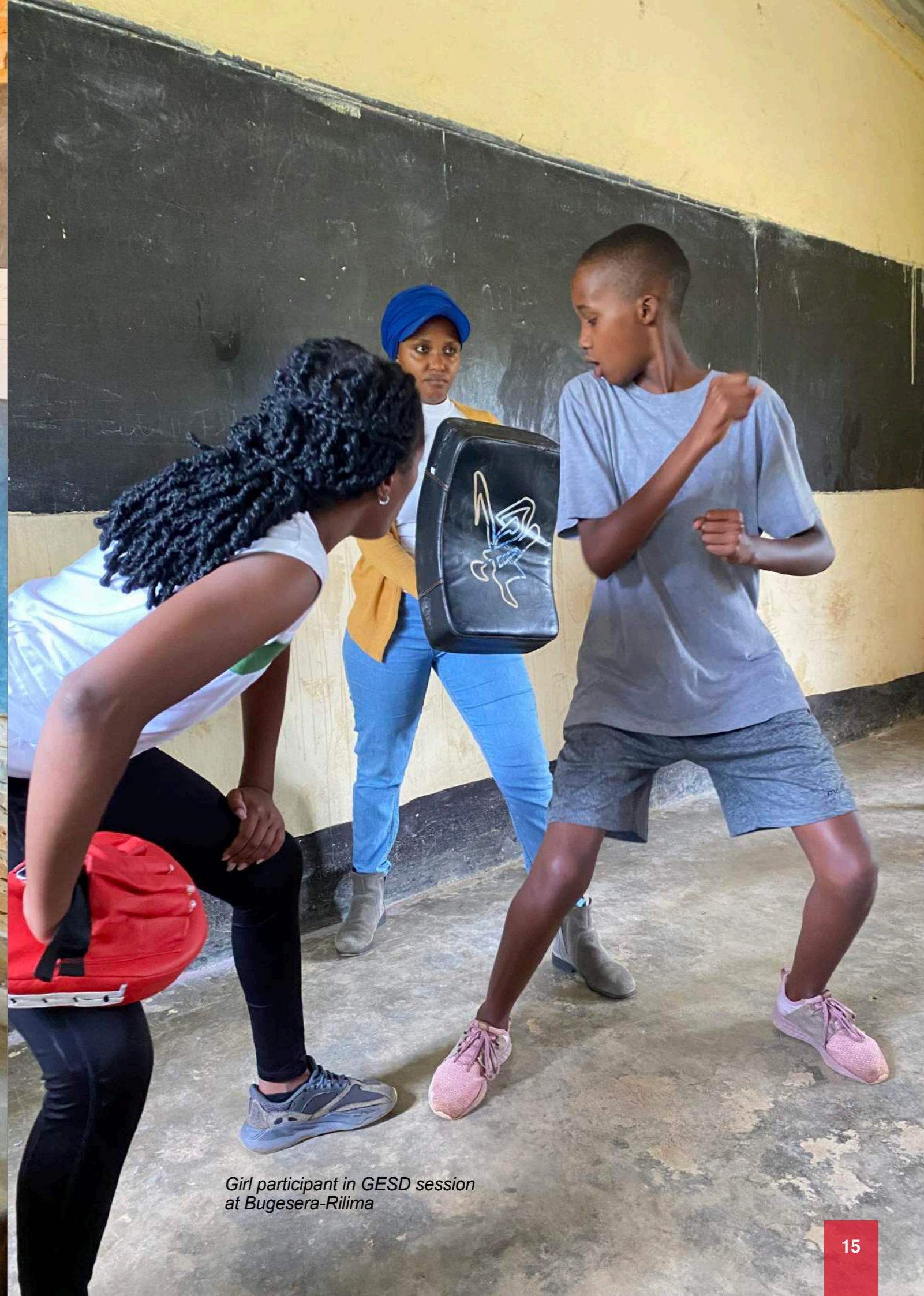
Girl participant in GESD session at Bugesera-Rilima